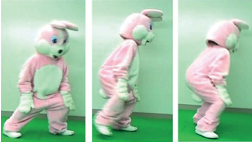
Figure 2. An example of manner of walking, used by Imai et al. [63], which sound-symbolically matches the novel word, ‘nosunosu’. In a pretest, Japanese- and English-speaking adults judged the novel word ‘nosunosu’ to sound-symbolically match this heavy and slow manner of walking. (Online version in colour.)

vocabulary and cannot yet take advantage of cues that have to be learned through experience. What other cues are available for such infants? Here, we propose that a biologically endowed ability to detect sound symbolism provides one such cue.